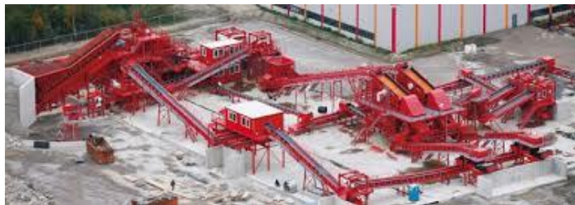
Figure 2. Stationary recycling plant in Amsterdam, Netherlands

Stationary concrete recycling plants are complex mechanized structure in which it is possible to achieve a controlled level of product quality, i.e. it does not depend exclusively on the homogeneity of the material exploited, since the space for pre-sorting and temporary storage is available. Afore mentioned impacts on reducing processing costs, because the costs of recycling achieve a significant increase with heterogeneity, and the presence of aggregates of harmful materials. Furthermore, the separation of different types of waste allows recycling of not only the typical construction materials, such as concrete and ceramic materials, but also of wood, plastic, glass and metal sectors in their use. Also, unlike mobile plants, they must be located in densely populated areas (still taking into account the site, because of the noise and dust, as supporting factors of such plants), and can work with the production rate and capacity up to 200,000 tons of recycled aggregate per year. Figure 2 is showing the largest stationary recycling plant for demolition waste in Europe, located in Amsterdam, Netherlands, which has a production capacity of 700 t·h -1 .