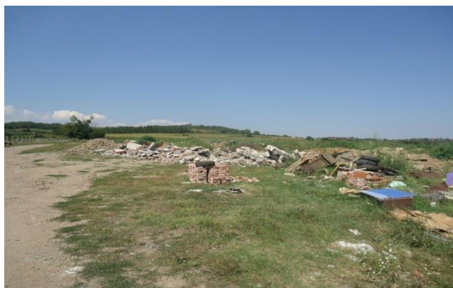
Figure 3. Landfill in Donja Jajna

At the landfill in Donja Jajna, shown in figure 3, owned by a public utility company "Komunalac" from Leskovac, arrive about 10 trucks daily in average, which would dispose amount of 50m 3 construction waste, of which approximately 40% of concrete, that would amount up to 20 m 3 of concrete.