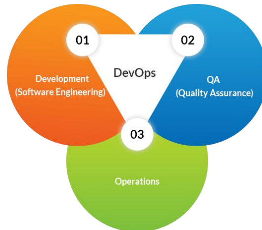
Figure 3. DevOps Model