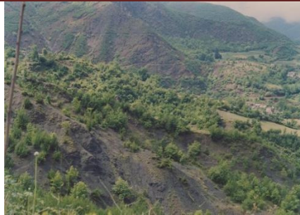
Photo 1. Mass wasting in central part of Shpat mountainous ridge