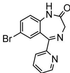
Figure 1. Chemical structure of Bromazepam.

Therefore, our objective was to develop a sensitive, reproducible, rapid, and cost-effective RP-HPLC method with UV detection for in-vitro dissolution test of Bromazepam tablets, which can be used in the same time as method for determination of assay, also.