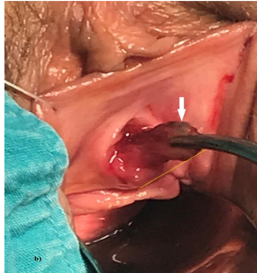
Figure 1: a) Urethral caruncle during pelvic examination;