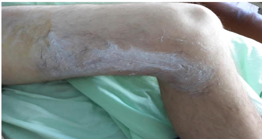
F 6: Local application of corticosteroid ungv.

Then corticosteroid ungv. is used to prolong the analgetic effect over the affected area (F 6) and to reduce the inflammation.