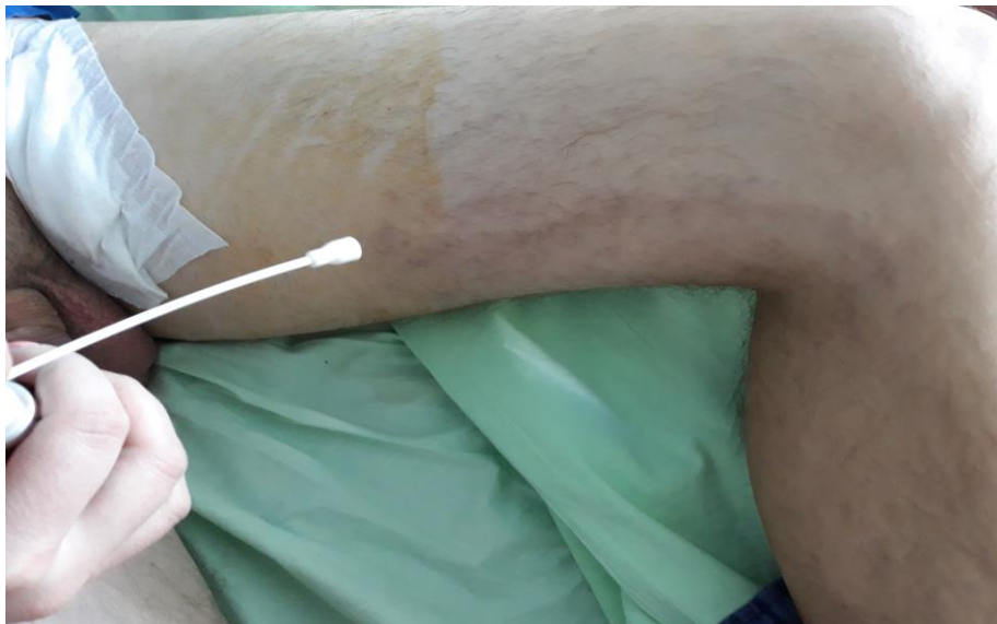
F 5: Local anesthesia with 10% sol. Lidocaini

In the last years we introduced a new method for local anesthesia. We use a 10% sol. Lidocaini over the affected superficial vein and the upper skin area. (F 5)