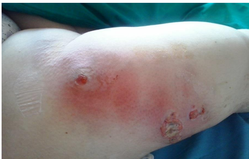
F 2: Infectious thrombophlebitis

In the rare cases of infectious superficial thrombophlebitis, the infection is introduced inside the veins, mostly after venous manipulations, by insects, traumatism or furunculosis (F 2).