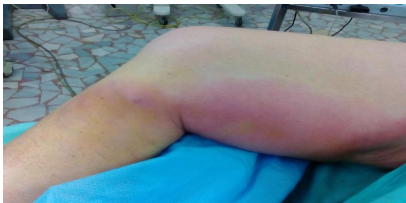
F1: Thrombophlebitis of Great Saphenous Vein

Superficial vein thrombophlebitis is a common inflammatory-thrombotic process that may occur spontaneously, after trauma or as a complication after medical or surgical interventions. In most of the cases it is a sterile inflammation of the vein wall and the surrounding tissue, accompanied by intravenous thrombosis (F 1).