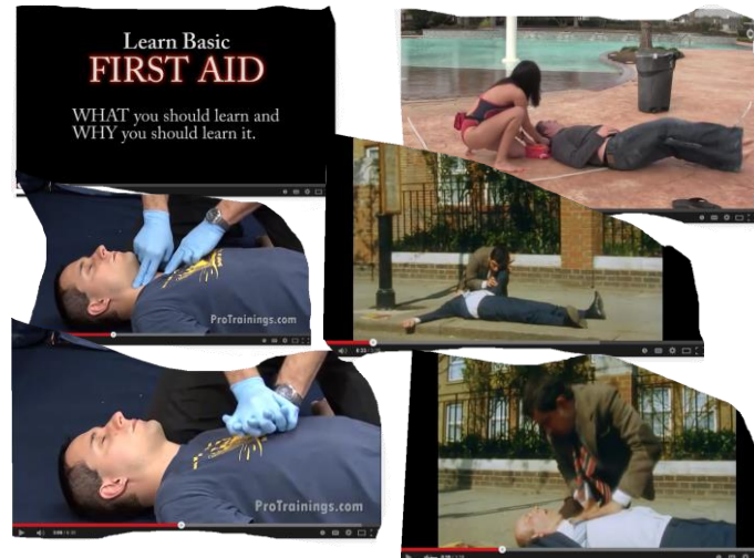
[3] Figure 3. YouTube as a tutorial

which the validated algorithm has been followed. (fig. 3) In order to make full use of the capabilities of this social network for first aid population training, it is appropriate that the practical exercises of each course be recorded on video that has to be kept in a restricted category. In this way, each of the students who have passed the course will be able to access at any given time the skills he/she has mastered to undertake a critical comparative analysis.