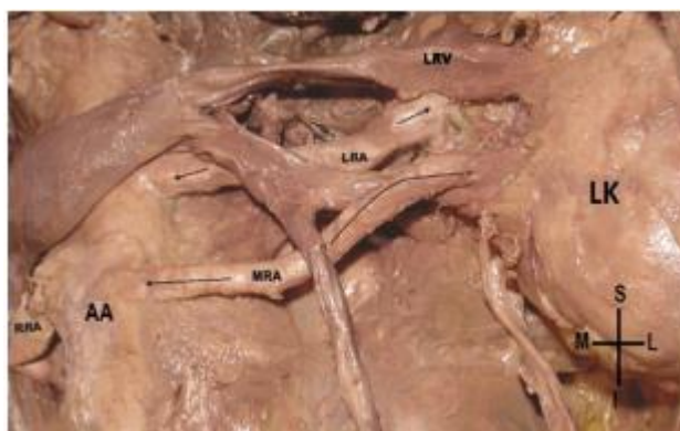
Figure 1 – Multiple renal artery (MRA) arising from the abdominal aorta (AA). RRA – Right renal artery, LRA – Left renal artery, LRV – Left renal vein, LK – Left kidney, S – Superior, I – Inferior, M – Medial, L – Lateral.

Except from a unique case where MRA originated from the AA bifurcation. MRA were found bilaterally in 13% (3/23) and unilaterally in 87% (20/23).