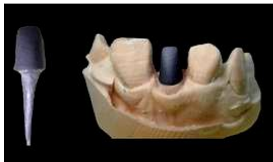
Figure 1. Cast metallic custom post-and-core.

A post-and-cores are dental restorations used to sufficiently build up tooth structure for future restoration with a crown, when there is not enough tooth structure for proper retaining, due to loss of tooth structure from decay or fracture. 1 Posts are cemented into root canals to enhance retention and to aid in creating a seal along the canal. 2 There are many different post-and-core systems, prefabricated and custom made, but none can provide perfect restorative solution for every clinical case. Prefabricated post-and-core systems are classified according to shape configuration, material and retention. 3 The methods of post retention can be active or passive.