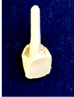
Figure 3. Post milling post from PEEK blocks.