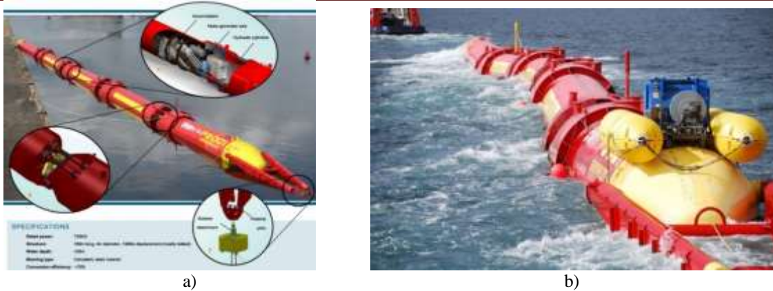
Figure 1. Pelamis machines