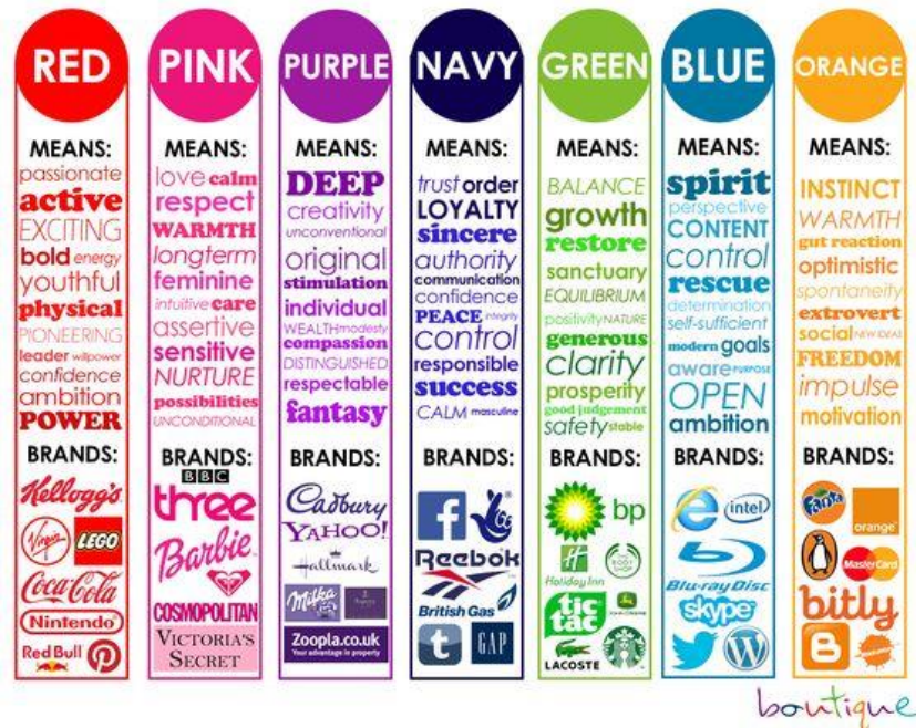
Picture 1.

4. We determine the positive correlation between knowing the meaning of certain color for advertising and its benefits to our products and services promotion. This research has shown that knowing the correlation between colors and psychology can lead us to successful business. The survey has shown that people employed in marketing agencies are familiar with knowledge of basic's color meaning as well as knowing its meaning in business and marketing context. They can apply this skill by identifying certain color and use it to create their product and its logo and visually attract more customers, who will love their product and feel safe by using it.